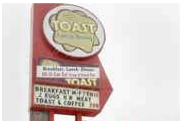
Toast Family Dining Ford Road and Harrison in GC

3. The Chamber of Commerce is also very pleased to introduce a new program to its business membership. Cable TV commercials. The chamber has recently contracted with Wide Open West or WOW for a commercial package. This package includes seven networks and six cities. In early 2010, all chamber member businesses will have the option to participate in this extremely affordable marketing program. Watch for these commercials on ESPN Sports, CNN Headline News, Hallmark, Lifetime, Cartoon Network, and the Food network. The spots will air in Garden City, Westland, Canton, Northville, Wayne and Plymouth. If interested in participating in the commercials, please contact the chamber office at 734-422-4448.